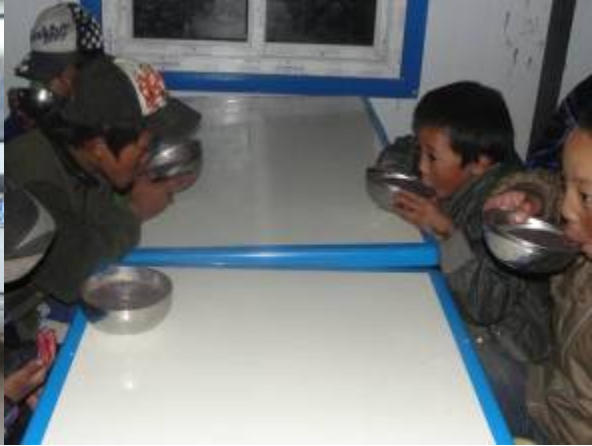
Children happily eating VitaMeal