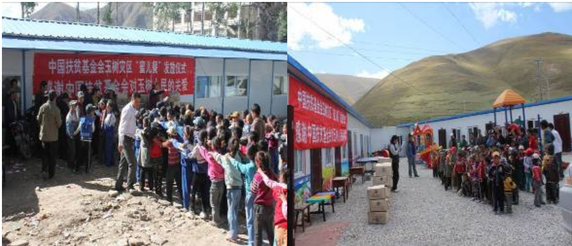
Students wait in line to receive VitaMeal