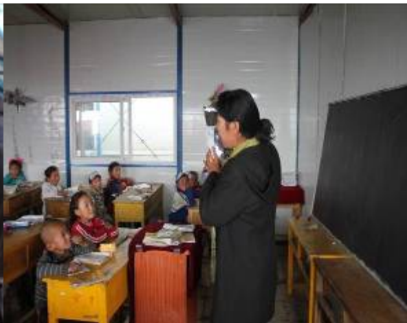
Teachers explain cooking methods for VitaMeal to students