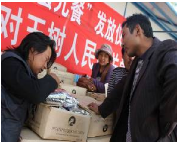
Project Officers explain cooking methods for VitaMeal to teachers