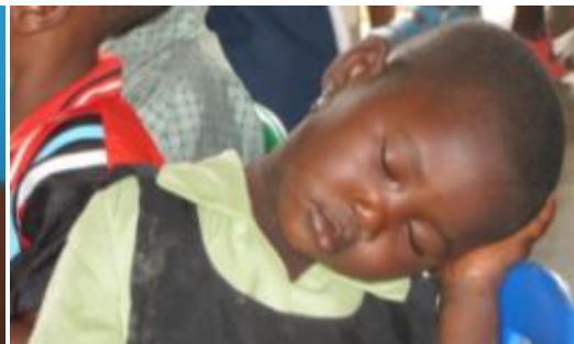
Sleepy student at the Nu Skin Germany Child Day Care Centre