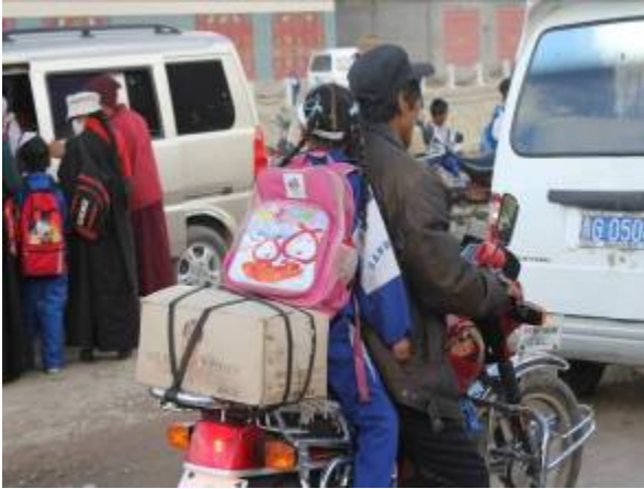
VitaMeal brought by the kids