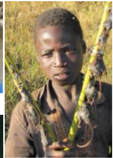
Boy selling boiled field mice on the street – a quick snack