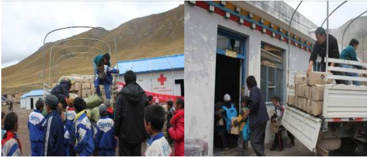
Students happily helping to unload