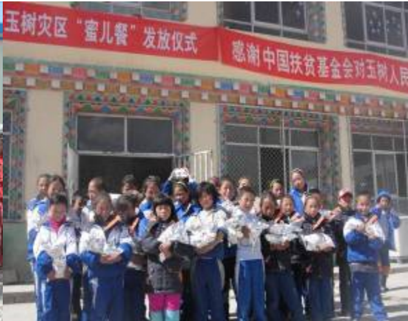
All the kids love the VitaMeal!