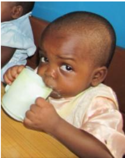
Abandoned baby at the orphanage founded by Mother Teresa

This year, because of your generous VitaMeal donations, over 67,000 children ate a nutritious meal every day. Unfortunately, that is just a start. Here are a few snapshots of precious Malawian children.