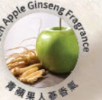
Green Apple Ginseng Fragrance 青蘋果人蔘香氣

配方含有α-羧基酸 (AHA) 以促進細胞更新， 確保肌膚保 持滋潤和健康 Contains skin-loving alpha-hydroxy acid (AHA) that promotes cell turnover, ensuring your skin stays moisturized and healthy