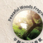
Peaceful Woods Fragrance 平靜的森林香氣

鎮靜舒緩零壓生活 Revitalizing aromatherapy helps provide positive mood support