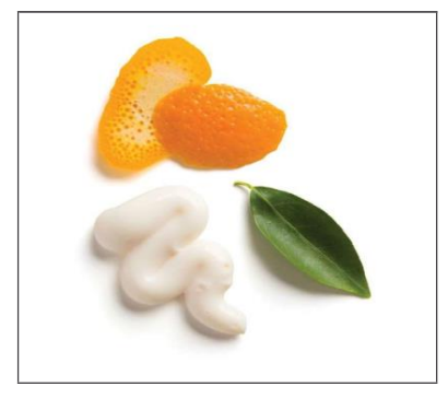
Our 180 Face Wash contains concentrated vitamin C and Ginseng extract - making it one of the most powerful antiaging cleansers around! #nuskin #antiaging #facewash