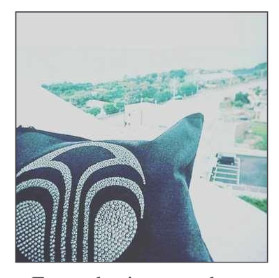
Every day is a new day to change your life! Consistency and hard work = flexibility to sit at home on the patio and build my business with Nu Skin