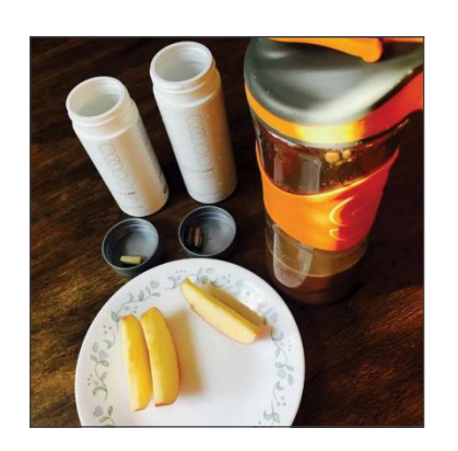
Good morning! Woke up today to wash up and listen to lectures #tr90 #nuskin