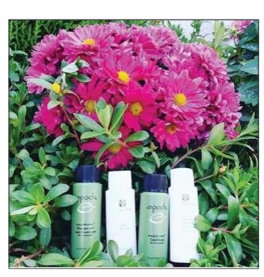
Nu Skin scientists work hard to use the best ingredients for clean, fresh products! The results speak for themselves!

The best spa is in your house! Apply the Glacial Epoch Marine Mud on your body or face (avoiding the eyes and around the mouth) Let the mud dry for 15-20min, then remove, rinsing with warm water! Simple as that!... And so gentle, it can be used up to 3 times aweek.