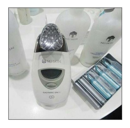
With a busy lifestyle, it can be hard to fit pampering into your week, so I always make a little ME time while giving my skin some much needed TLC! #healthyskin #metime #spaday #nuskin #galvanicspa