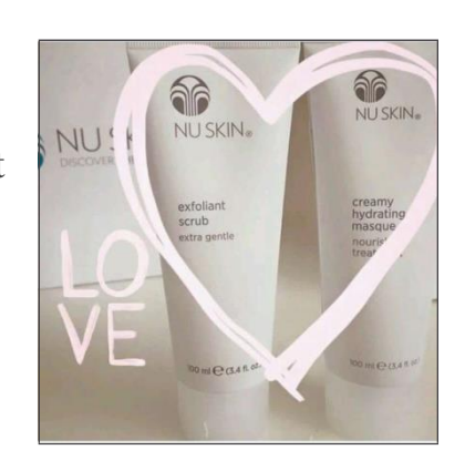
Take care of your face better with Nu Skin!