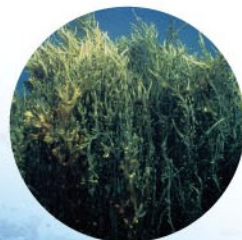
棕色海藻 The Brown Algae

Tricalgoxyl® was developed by a European laboratory with over 40 years of experience in the field of trichology. Formulated with a brown algae (seaweed) grown and collected on the Iroise Biosphere Reserve in France, Tricalgoxyl® works with other essential ingredients to remineralize the scalp and enhance hair vitality.