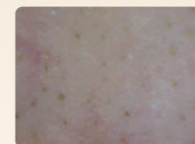
使用後 - 黑頭明顯減少，毛孔回復幼細 After - Pores are significantly diminished and oil is controlled.