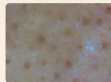
使用前 - 毛孔粗大，黑頭嚴重 Before - Visible pores and excess sebum