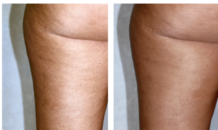
Before treatment, cellulite visible After treatment, cellulite reduced

Capillary and lymphatic circulation improvement can also assist with the treatment of cellulite. An extract of Chrysanthellum indicum can reduce edema and inflammation and promote tissue drainage and the elimination of toxins.