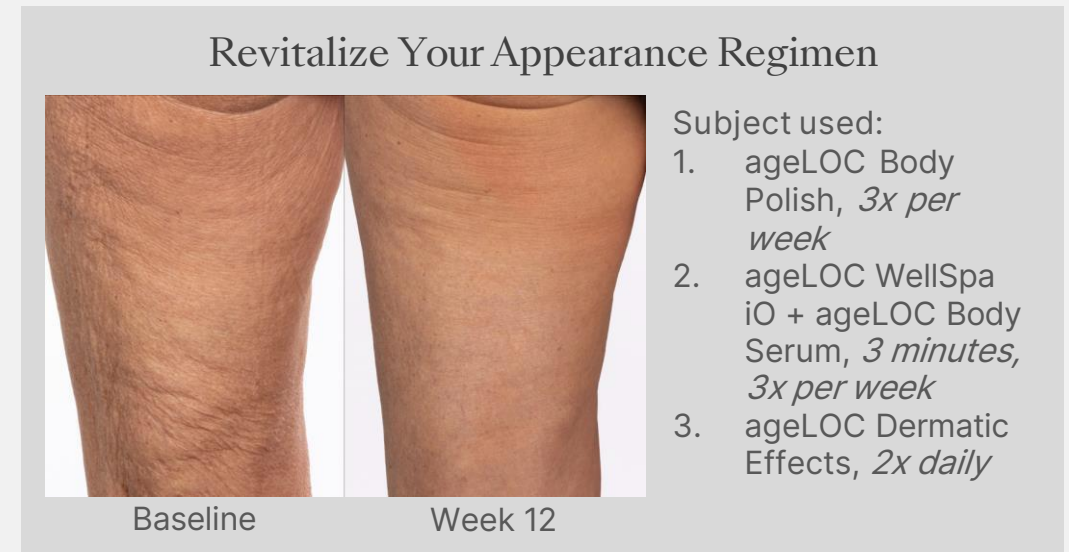
Sample Before & After Photo