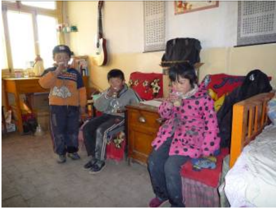
“Left – behind” children of Lintan County Liuxiang Central Primary School tasting VitaMeal.