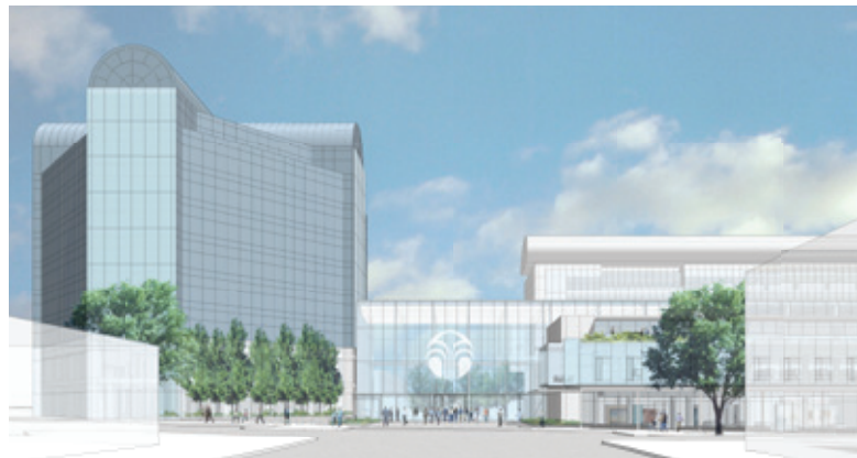
The Nu Skin Enterprises Center for Anti-Aging Research will add 2,400 square feet for a total research facility of 18,000 square feet.

The Nu Skin Innovation Center represents the company's commitment to continual innovation in all aspects of its business—particularly in its product and opportunity development. The new corporate campus will feature a state-of-the-art anti-aging research center, technology hub, and modern meeting and work spaces. As Nu Skin builds for the future , the center will become a landmark in the community and an enduring symbol of the difference Nu Skin demonstrates through its people, product, culture, and business opportunity.