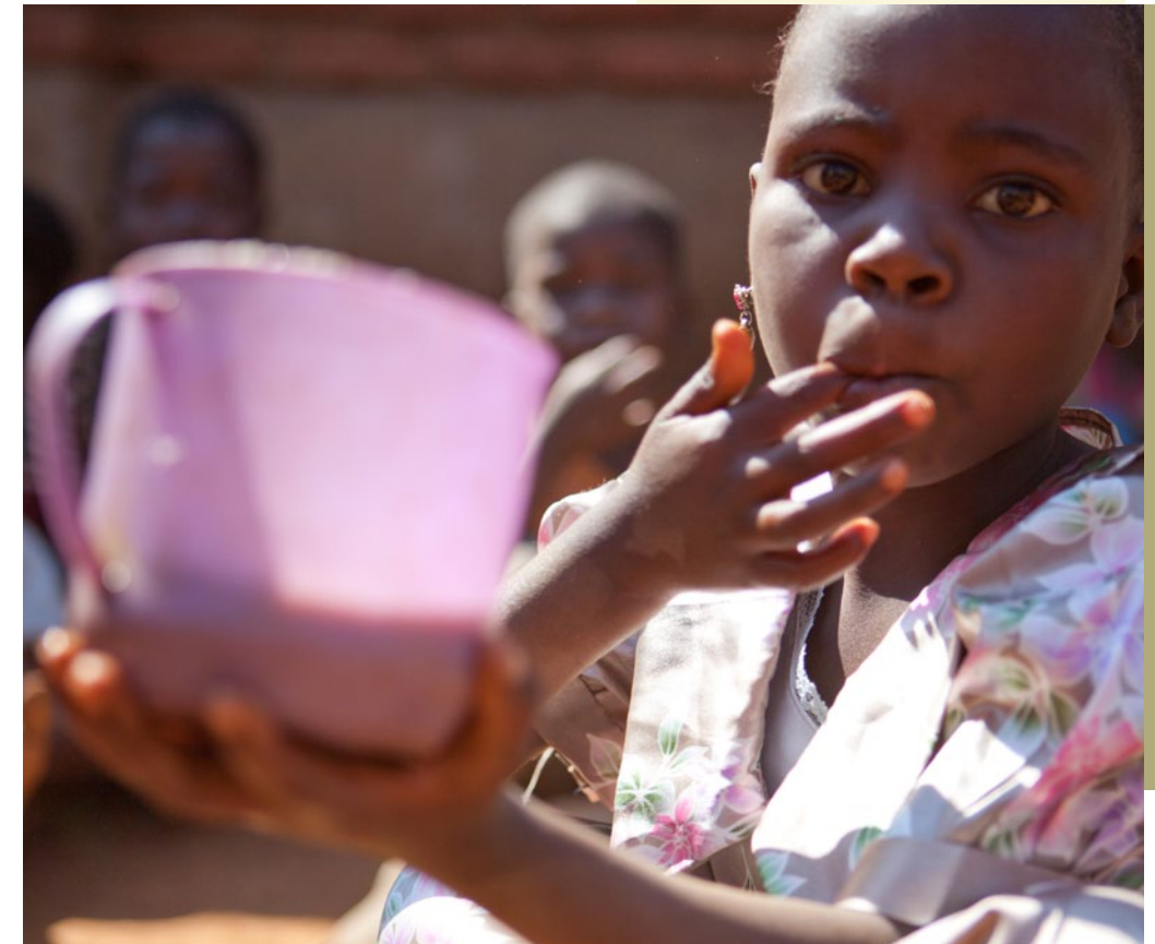
NOURISH THE CHILDREN