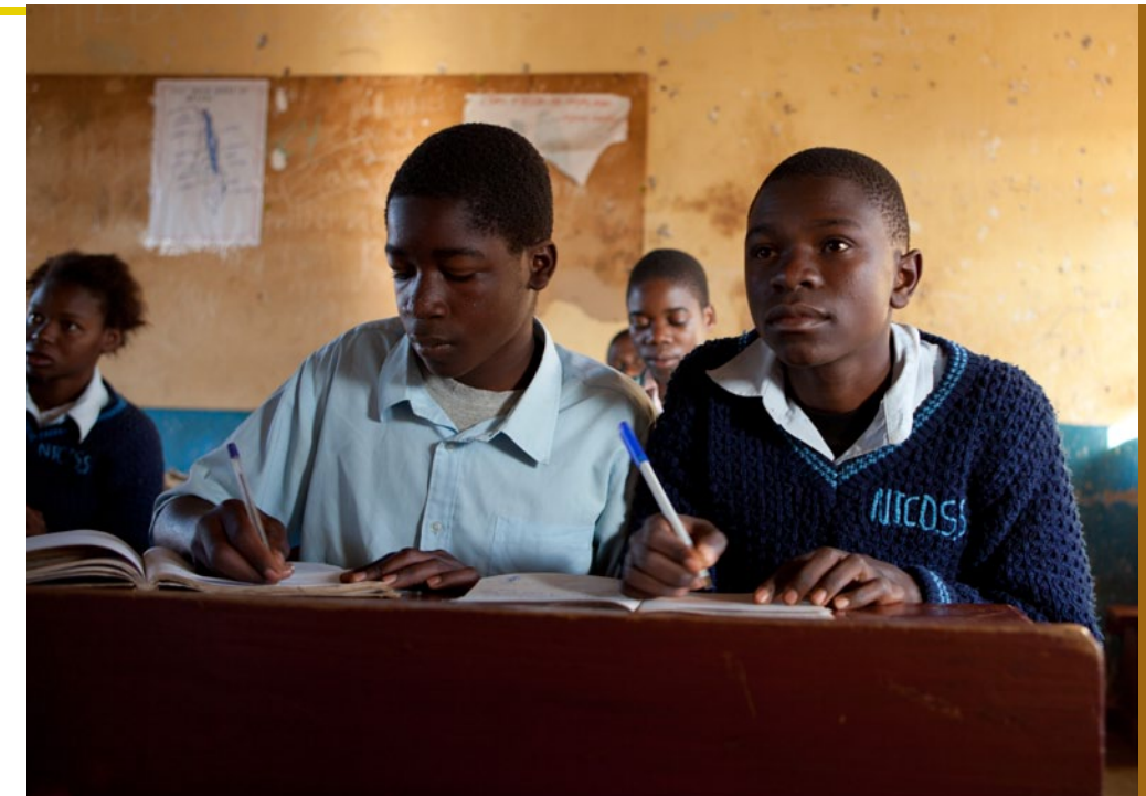
NU SKIN FORCE FOR GOOD FOUNDATION

Students in Malawi must pay for their schooling after primary school. The Educate the Children (ETC) scholarship program provided tuition, uniforms, and books to 74 secondary and post-secondary students in Malawi last year. The students participating in the program are receiving diplomas in a variety of areas, including computer science, medicine, and environmental health, and are becoming role models for a rising generation of Malawians. Another 60 students have already received diplomas.